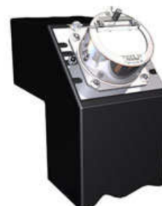
Tigex 25 (60300E) with separate universal adapter (60351E), shown at 45° angle