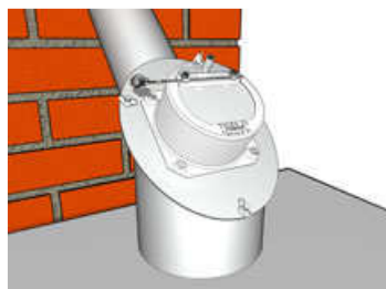
Tigex 25 (60300E) with separate adapter (60361E), shown at 45° angle