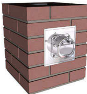
Tigex 25 (60300E) with separate adapter (60355E) for embedding in brick