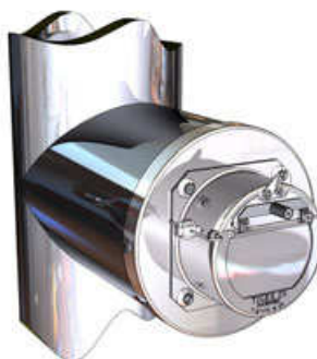
Tigex 25 (60300E) with separate adapter (60364E) for insulated T with OD 180 mm