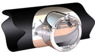
Tigex 25 with integrated adapter (60390/130E) for round flue pipe Ø130 mm