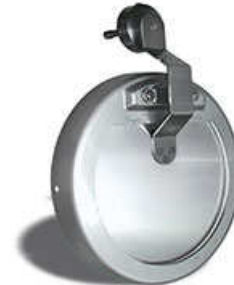
NEW! Tigex 50 »

Output up to 25 kW Max. chimney height up to 8 m Max. chimney dia./area Ø130 mm/169 cm 2