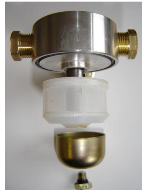
10 mm Compression Fitting

The replacement filter kit TM4600F is supplied with a new filter element, a filter bowl sealing "O" ring, a new collapsible seal for the filter bowl and 10mm Hex Screw